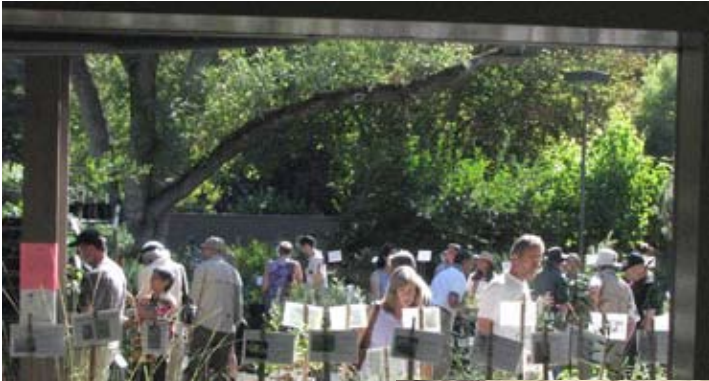
Left: A great crowd on opening day