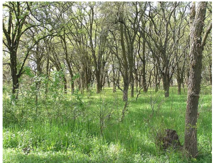
Riparian Forest along the Cosumnes River, near Mokelumne City.

Thus the river ebbs, flows and floods with the seasons, through one of the biologically richest regions in the Central Valley. More than 250 bird species, more than 40 fish species, and over 400 plant species have been identified on the Preserve.