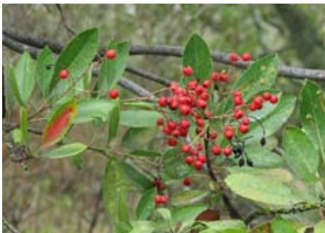
Toyon berries on the Parkway.

Wildflower seeds, books and Sacramento Valley Chapter t-shirts are available for purchase at meetings. Refreshments provided!