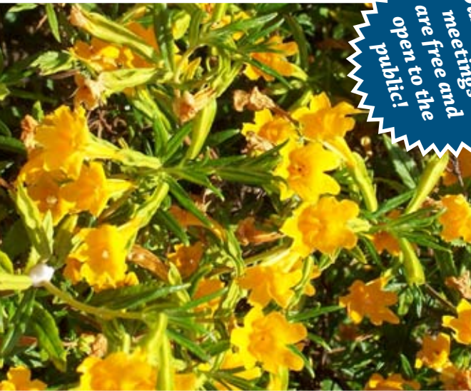
Mimulus aurantiacus

Fall Plant Sale Sat., Sept. 19, 10 a.m. - 3 p.m. Plant List inside!