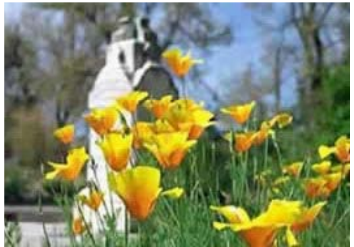
Poppies cheer up the cemetery