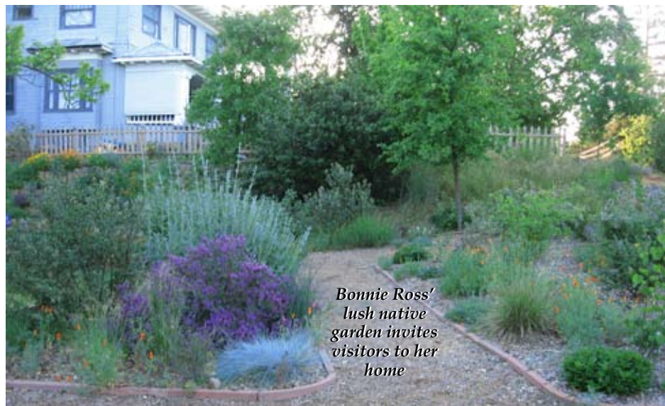
Bonnie Ross' lush native garden invites visitors to her home