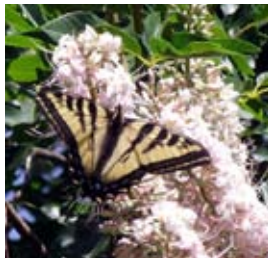
Western tiger swallowtail and buckeye