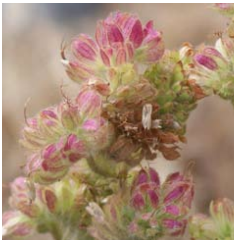
Phacelia imbricata