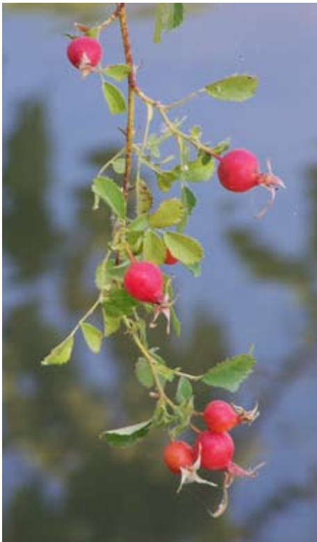
Rosehips by the river