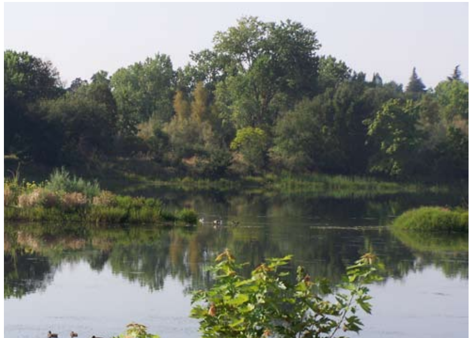
A view of the American River from William Pond Park

In August, the Rose Foundation for Communities and the Environment awarded Elderberry Farms a grant of $6,500 to support riparian restoration on the American River. This funding will enable the nursery to purchase a badly needed shade structure. Thanks to previous grants from the Sierra Club, Jones & Stokes, and EDAW we were able to purchase fencing, shed building materials, a watering system design, and a GPS device. We are sure to have a shade structure assembling party in the near future. If you can help, please let us know!