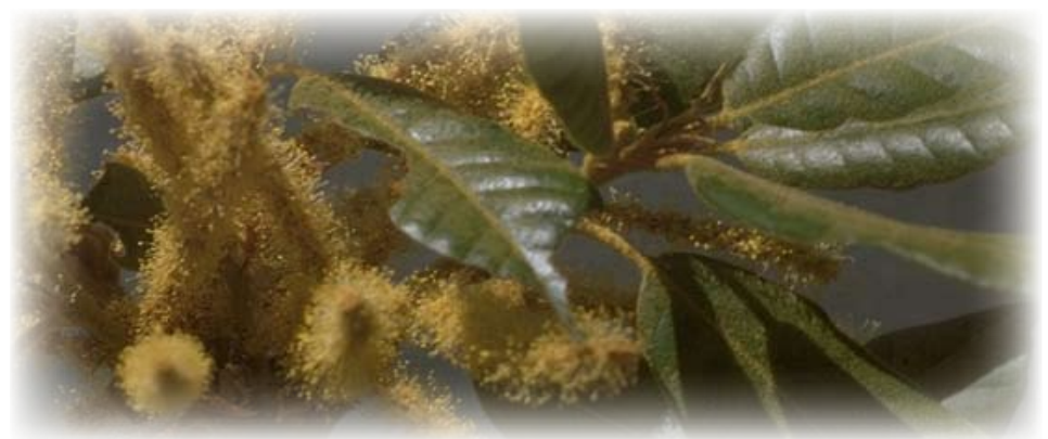
Lithocarpus densiflorus ; Tan-bark Oak

< http://ucjeps.berkeley.edu/workshops/2008/index.html#Nov23 >