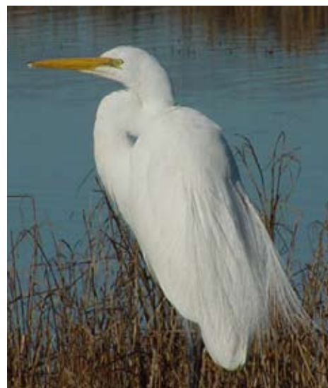
Great American Egret

Fee: $80 includes all lectures and field trips. Pre-registration is required.