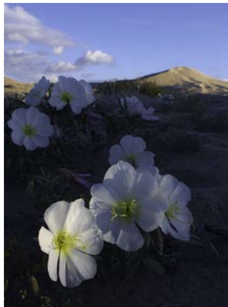
Kelso Dunes Primrose by Ree Slocum

“Conference Choice” - The cover of the CNPS 2009 Conservation Conference: Strategies & Solutions Proceedings to be published in 2009.