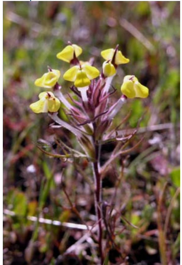
Triphysaria eriantha

For the details about these workshops and how to register, please go to: www.csuchico.edu/biol/Herb/Events.html